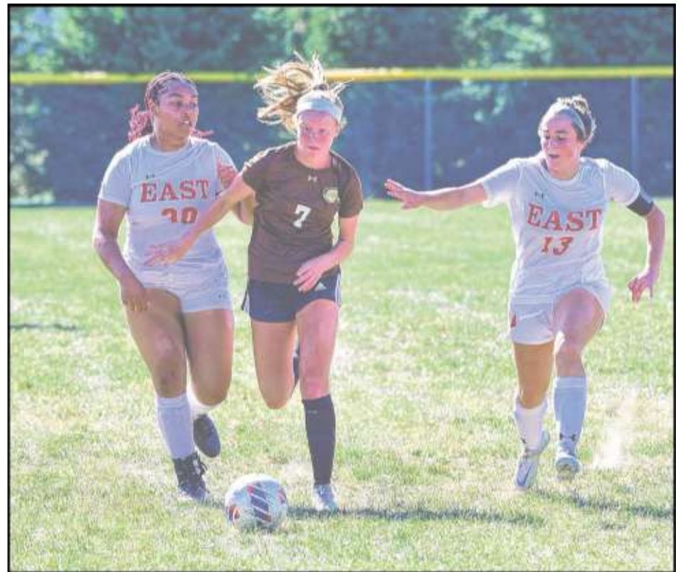
Summer Hill is back for the Becahi girls soccer team.