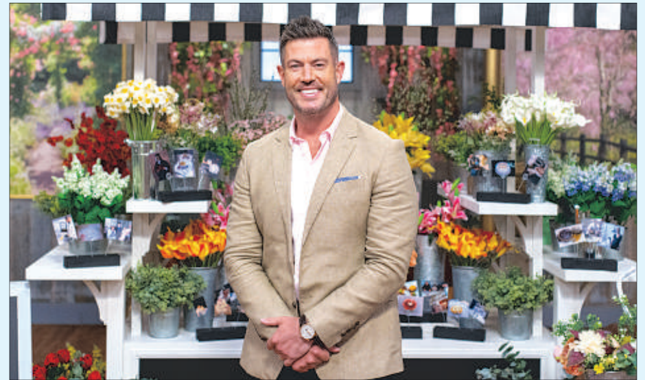
Jesse Palmer hosts "Spring Baking Championship"

Plant your annuals, then plant yourself on the couch: "Spring Baking Championship" continues with all-new episodes, airing Mondays on Food Network.